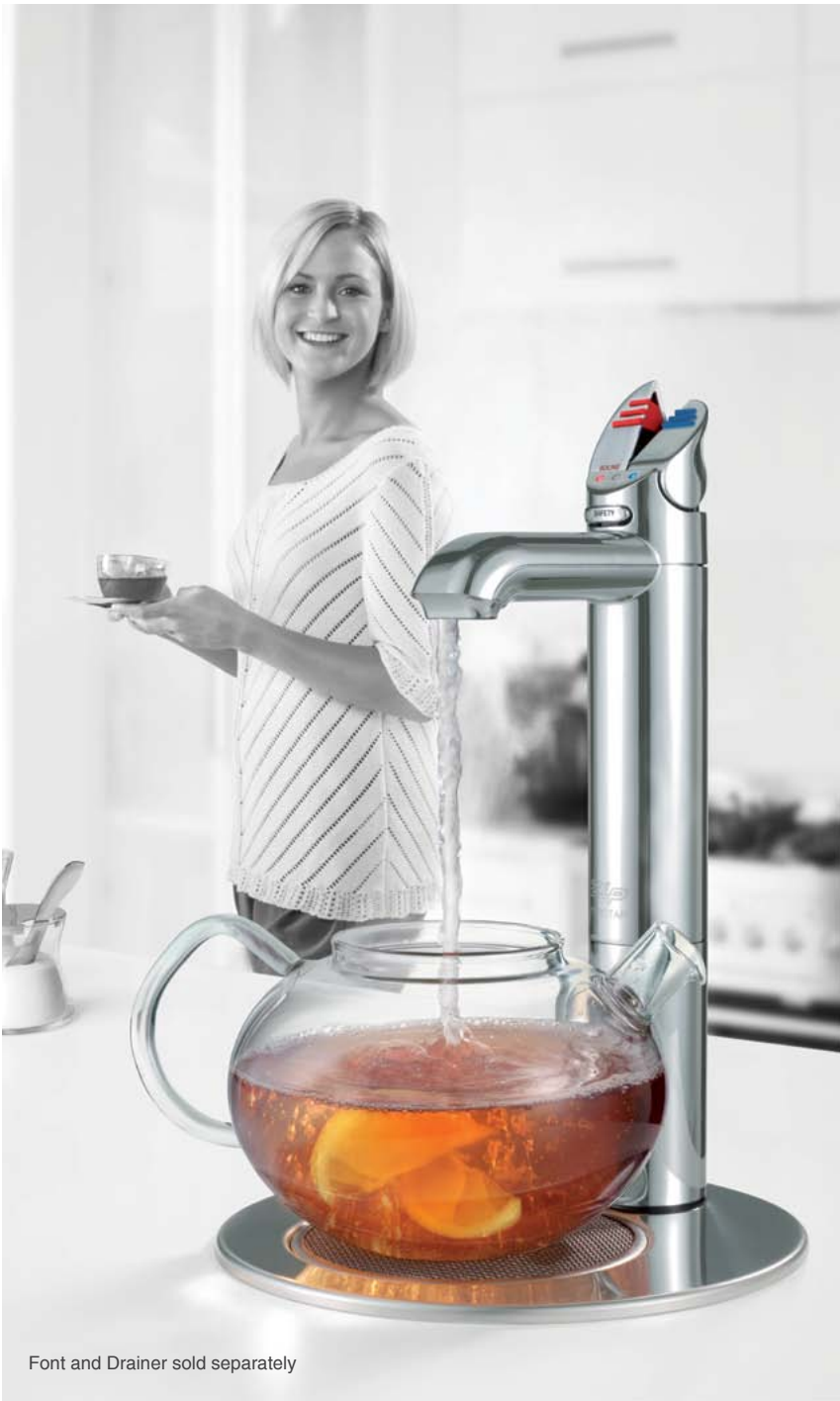
Font and Drainer sold separately