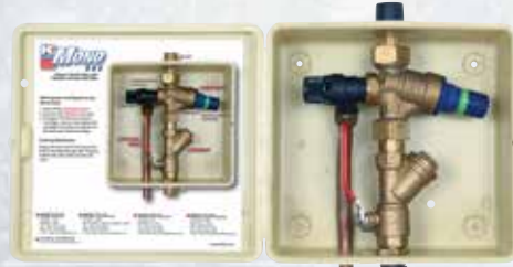
House Water Station