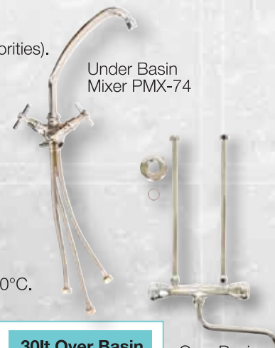
Under Basin Mixer PMX-74

Faulty Thermostats and Elements can be replaced when necessary.