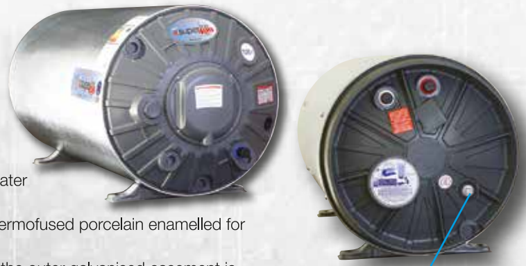
Renewable energy ready connection