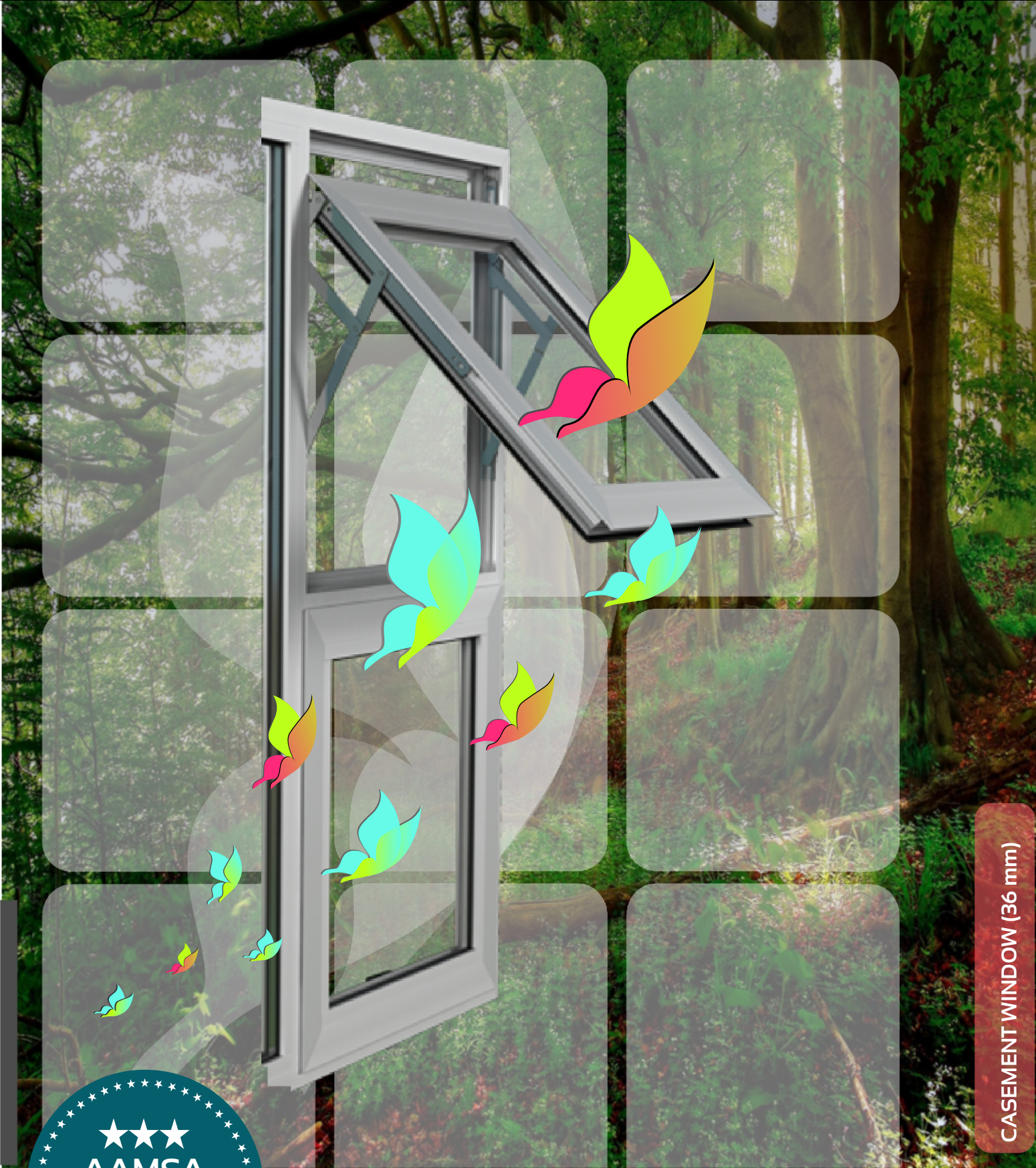
CASEMENT WINDOW (36 mm)

This brochure must be read in conjunction with the Installation, Cleaning & Maintenance Guidelines for the relevant system. The manuals must also be used in conjunction with the design and cutting lists from the latest version of StarFront.