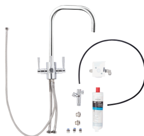
ZIP WATER PURIFICATION KIT