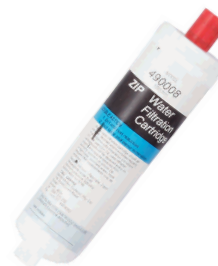
ZIP FILTER CARTRIDGE