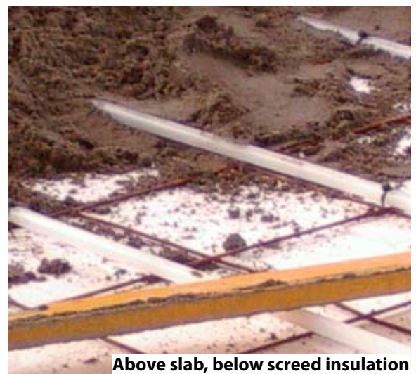
Above slab, below screed insulation