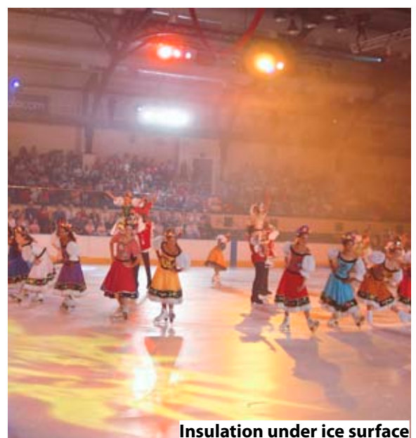
Insulation under ice surface