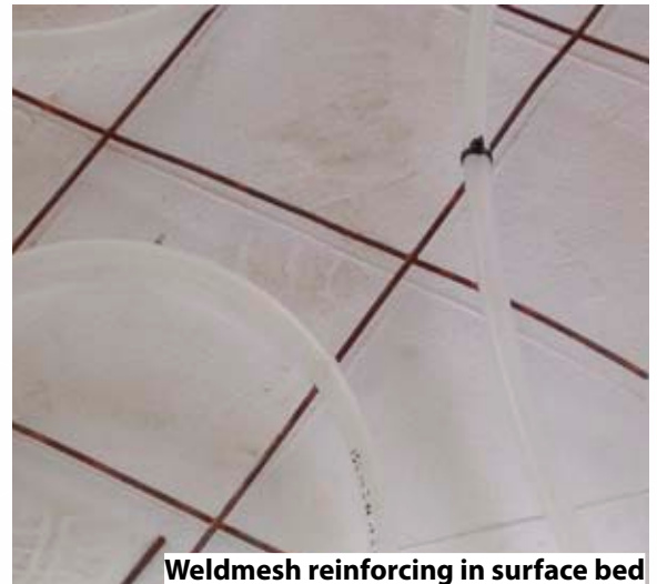
Weldmesh reinforcing in surface bed