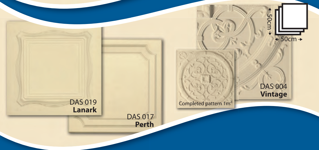
DAS 019 Lanark