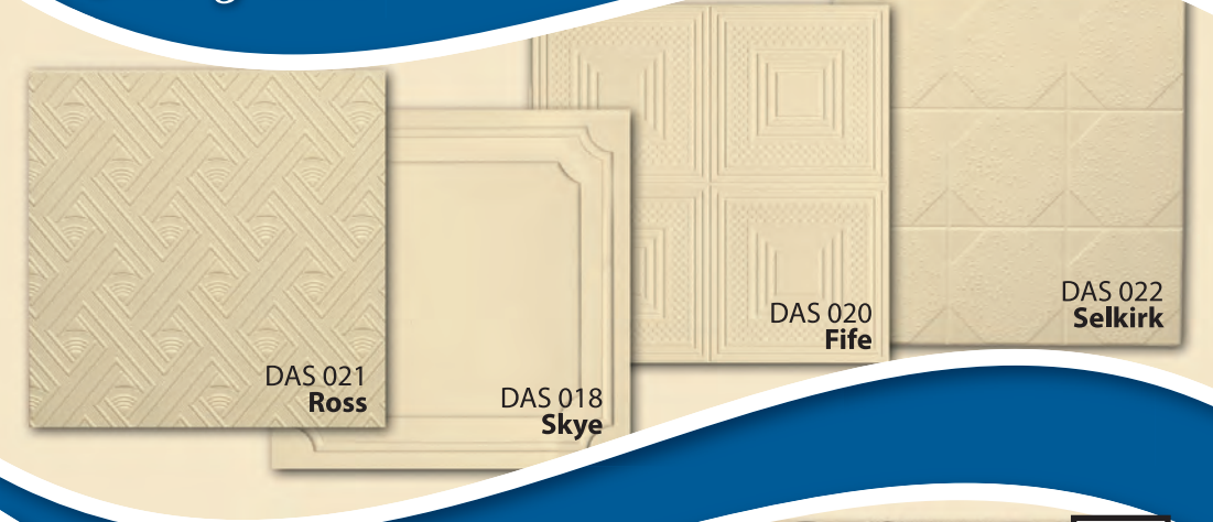
DAS 021 Ross