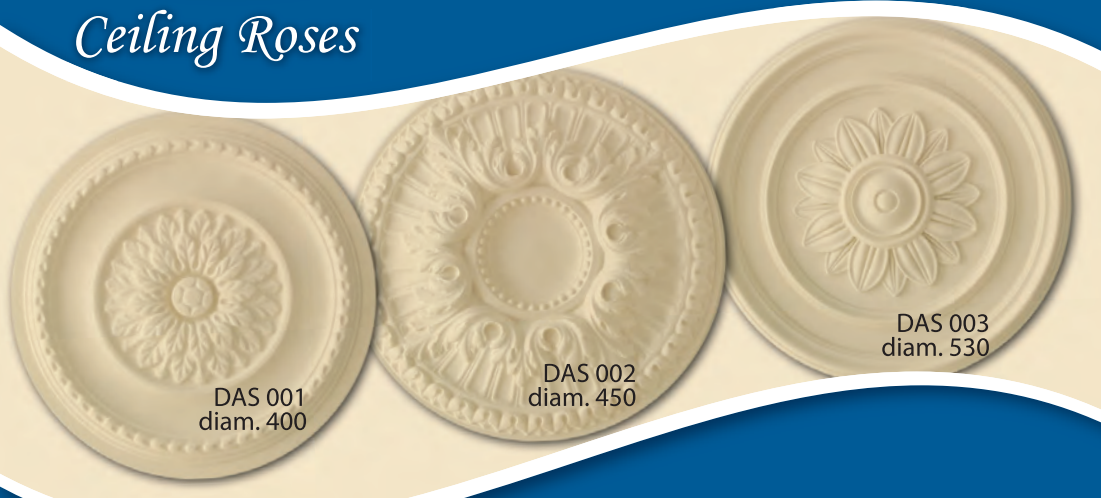
DAS 001 diam. 400